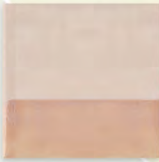
TM5 751 Dark Eggshell