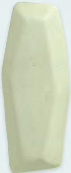
Muted Jade TM5 754