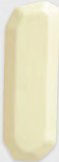
Butter Yellow TM5 752