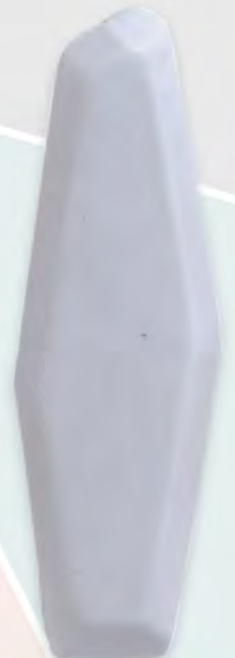
Violet Mist TM5 757