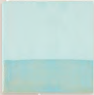
TM5 755 Celadon Blue