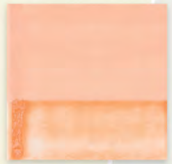
TM5 753 Frosted Citrus