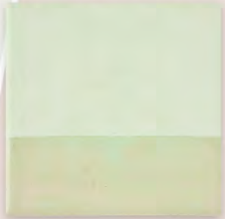
TM5 754 Muted Jade