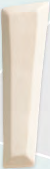
Weathered Porcelain TM5 750