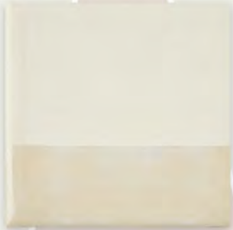
TM5 750 Weathered Porcelain