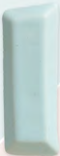
Celadon Blue TM5 755