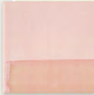
TM5 756 Antique Rose