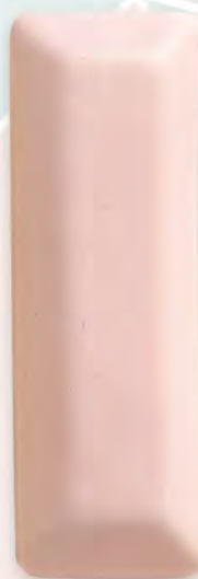
Antique Rose TM5 756