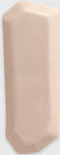
Dark Eggshell TM5 751