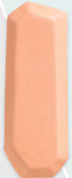
Frosted Citrus TM5 753