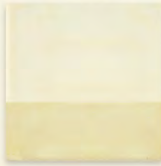
TM5 752 Butter Yellow